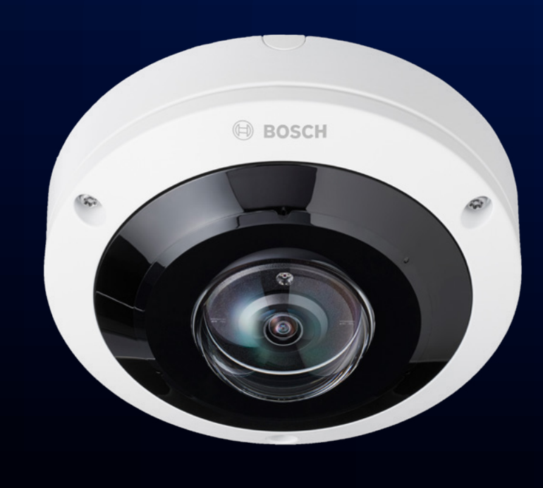
FLEXIDOME panoramic 5100i IR