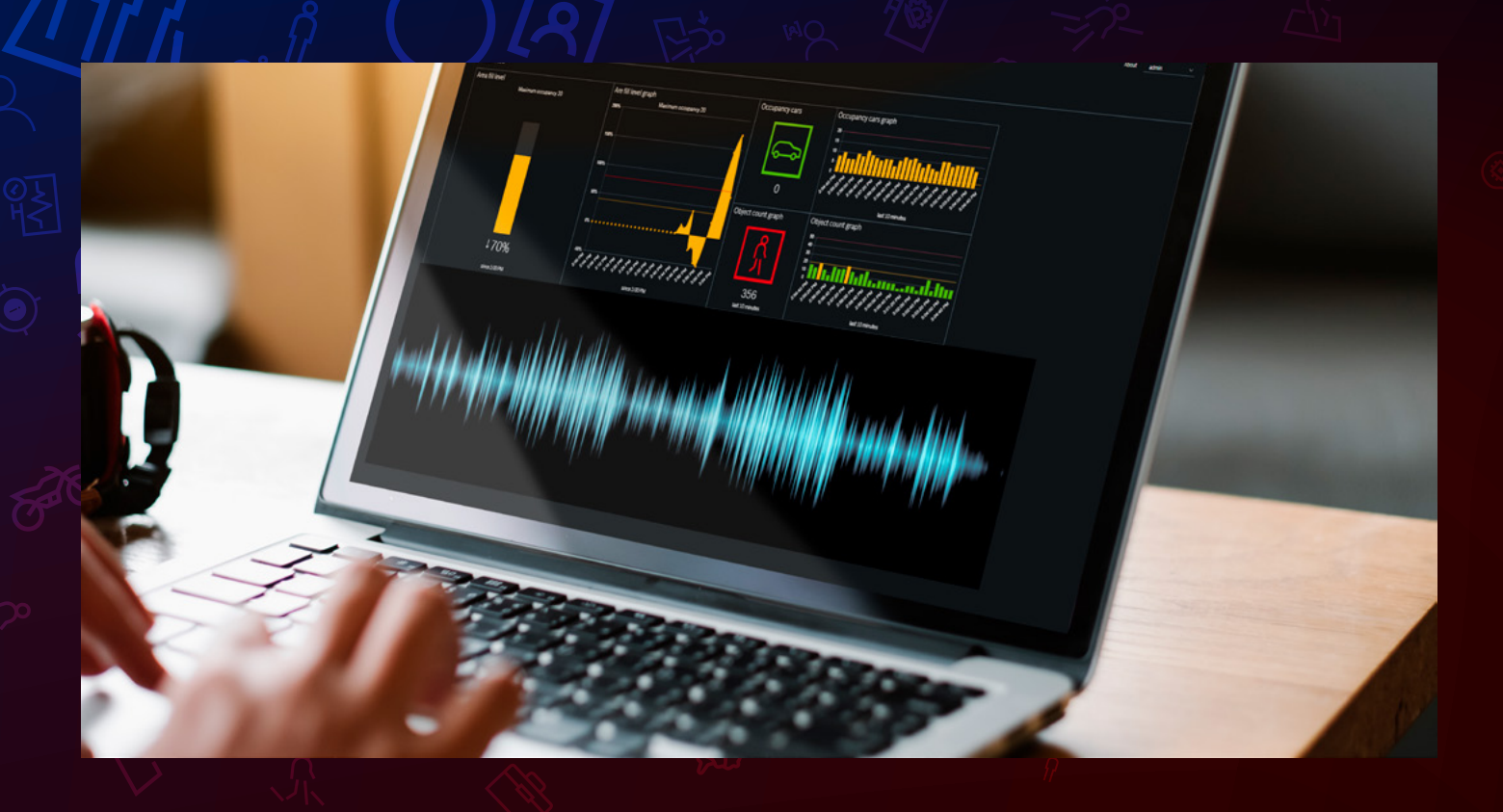
Support informed decisions with video management software